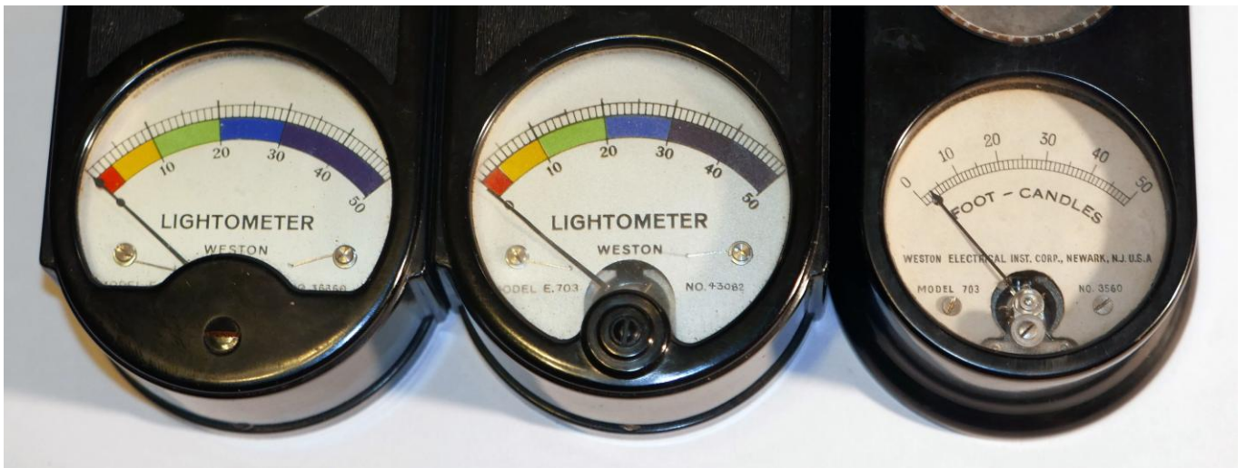
Fig.6 Variations in meter housings between two of the UK models (left and centre) and the American model (right) with its smaller meter. The UK model (centre) has a meter zero adjustment that stands proud of the top face.

Over the production span of the E703 in the UK, minor variations in the bakelite casting around the meter are evident. Figure 6 compares variants of the British model with its US counterpart. The centre example in the photograph, which reveals the largest proportion of the meter face on the UK model, has the zeroing adjustment screw riding proud of the main bakelite body molding. The leftmost unit has the bottom part of the meter encased in bakelite and also provides a flush screw adjustment for zeroing the meter needle. This design is present in both the Surrey and Sangamo models. Figure 7 shows an alternative configuration of the US model where the meter face disk has been paired off at the bottom. It concerns only the meter assembly under the glass, with no changes in the bakelite case.