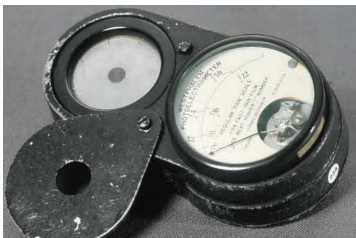
Fig.1: The Westphalen Exposure Meter, 1931, George Eastman Collection, Rochester, USA. Picture courtesy of S A Spaans (1)

And, just like Chinese Terracotta Warriors or Cabbage Patch Dolls (remember them?) no two of them appear to be exactly the same, no matter how many you come across. Differences between the US and British models notwithstanding, Photronic cell variations, luminance ranges, badging, patent numbers, meter face legends, meter apertures, colour coding of workplace levels, level markups on the meter face and back plate information are all at variance. Oh! And that doesn't include a permanently mounted incident light integrator (the Invercone on an exposure meter) on some examples.