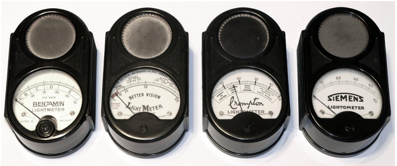
Fig.9 Four Surrey bespoke manufactured E703 meters for (left to right) Benjamin, Better Vision, Crompton and Siemens. Each meter face displays the company's header and scale variations range from the use of lettered zones (A to E) on the far left example, Zone mark-ups on the face (centre two) or unassigned luminance values (right). In this case, recommendations are provided by Siemens on a separate card included with the meter.

The majority of the UK meters have serial numbers running in close order from pre 30,000 to the late 40'000s with one apparently much later at 70,000. The bespoke feature of the E703 manufacture has already been mentioned. Of this series, the native Weston Lightometer (figure 8) is joined by models badged for Benjamin, Better Vision, Crompton and Siemens (figure 9). The serial numbers appear to hold across these variants since none of them are prefixed with any letters that could relate to the vendor (such as a 'B' for Benjamin). It looks as though the Surbiton factory ran the serial numbers in production batch order, regardless of whose name would eventually appear on the meter face. But I could be wrong.