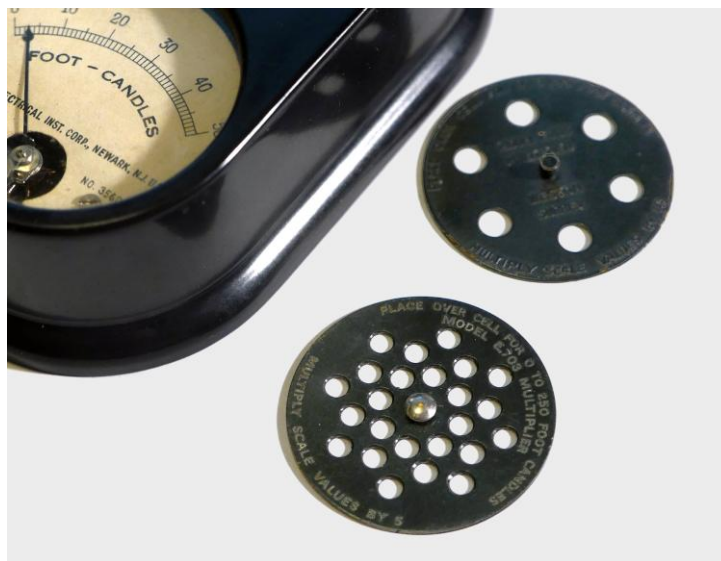
Fig.2 The x5 (lower) and x10 (upper) baffles (multipliers) available for the Lightometer, which can be placed directly on the cell to allow for measuring higher lighting levels.

Though the Westphalen meter returns an f number (camera lens aperture), its relation to the E703 also lies in the absence of a third component, the exposure calculator dial. This was a notable innovation by Weston, turning a simple light meter into a versatile and powerful instrument for establishing photographic exposure. For a workplace light meter it is not necessary, so the Westphalen and the E703 appear as 'brothers in arms'.