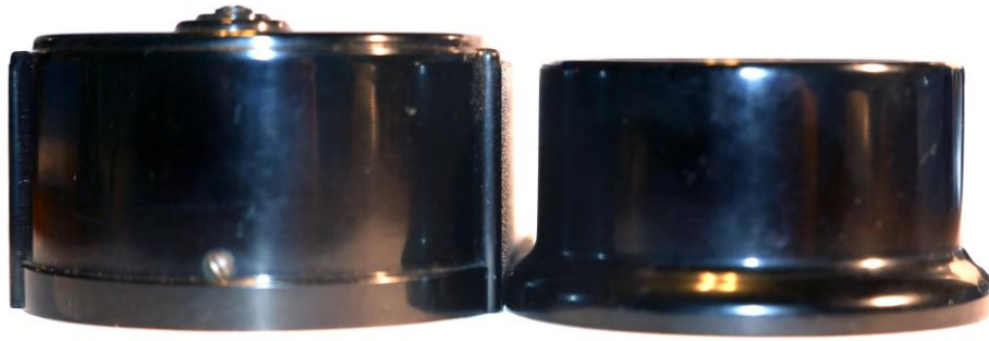
Fig.5 End profiles of the UK E703 (left) and US 703 (right) showing the shallower depth of the US model and its slimmer shape. The raised molding on the UK model to house the needle zeroing adjustment is also evident.

Over the production span of the E703 in the UK, minor variations in the bakelite casting around the meter are evident. Figure 6 compares variants of the British model with its US counterpart. The centre example in the photograph, which reveals the largest proportion of the meter face on the UK model, has the zeroing adjustment screw riding proud of the main bakelite body molding. The leftmost unit has the bottom part of the meter encased in bakelite and also provides a flush screw adjustment for zeroing the meter needle. This design is present in both the Surrey and Sangamo models. Figure 7 shows an alternative configuration of the US model where the meter face disk has been paired off at the bottom. It concerns only the meter assembly under the glass, with no changes in the bakelite case.