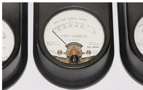
Fig.7 A variation of the meter needle zeroing assembly on the US model.