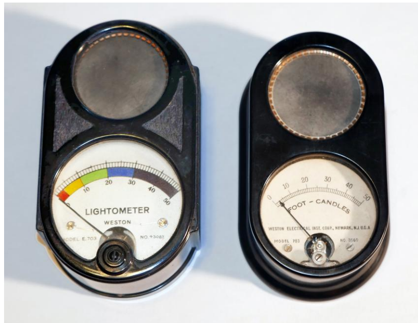
Fig.3 A direct comparison between the UK model E703 (left) and the US model (right).

The post-war model 756 was a precision unit similar to the 603 in specification, along with its three range switch and twin celled cable mounted probe. Superseding the 603, the meter box was made of bakelite. There were several variants of this model and, as with the E703, some of them appear as bespoke items badged for other companies.