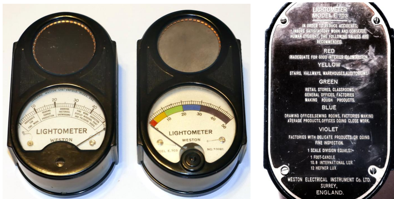
Fig.8 Two Weston badged Surrey manufactured E703s. The workplace recommended lighting Zones are specified by text (left) and colour coded on the right hand example. On this variant, the workplace zones are listed on the back plate of the meter (right).

The degree of variation in different examples of the model E703 Lightometer has already been emphasised in this abstract. I have eight UK models in my collection and, whilst this is as many as I want, it is not enough to comprehensively unpick these variations, and certainly not enough to pin them to any timeline. Patent numbers are of little use here. As a whole, four patents apply to the model 703 meter (as listed on it), but these are all US registered in years: 1926, '27, '28 and '35. The patents of the '20s relate to developments in train before these meters with the Photronic cell were developed. The patent of 1935 covers the unified design of the American 703, registered at least two years after production of the model had begun.