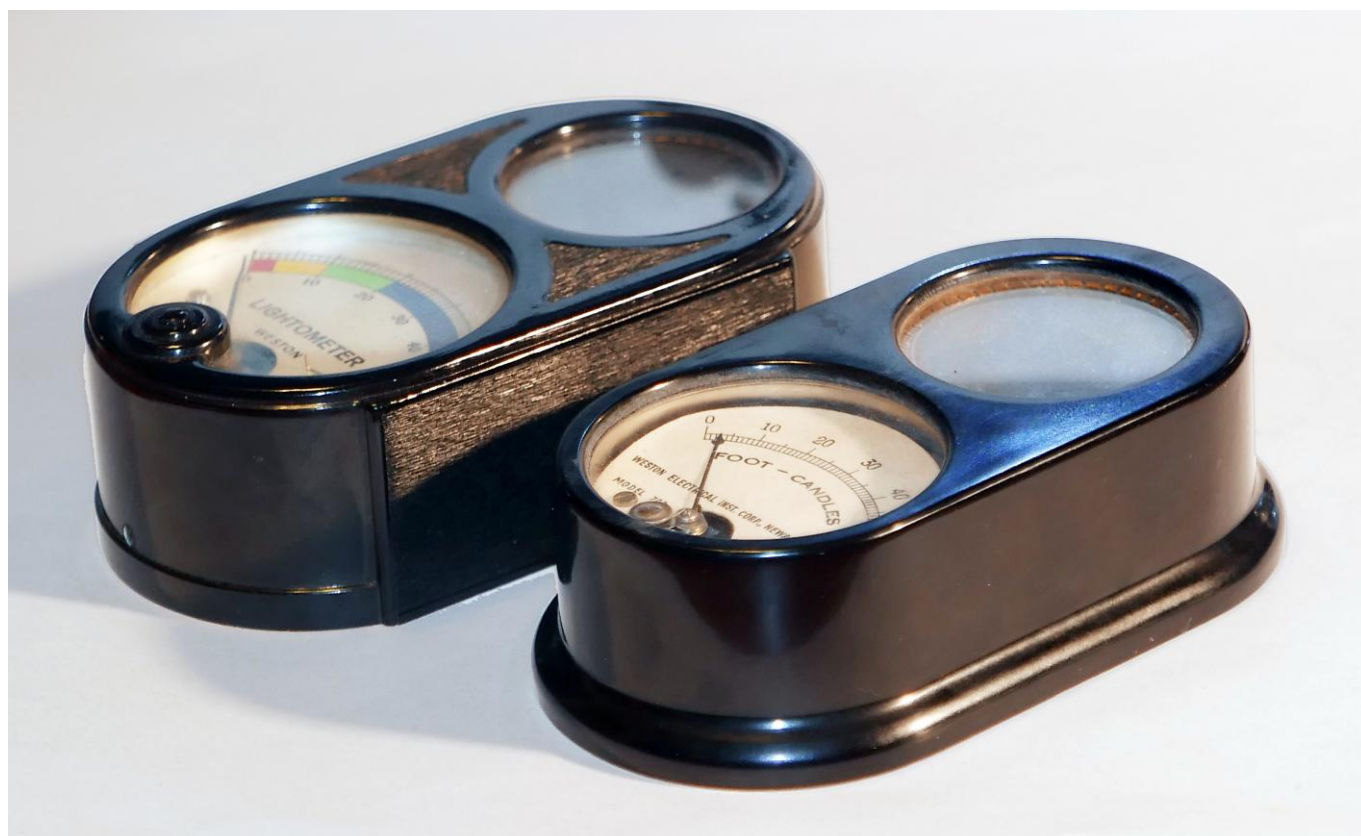
Fig.4 The British model E703 (left) has a larger profile than the US model (right) with squared-off sides and patterned finish on the bakelite shell, in comparison to the smooth finish on the US model.

Figure 3 shows the British and American models side by side. What is immediately apparent is that the UK version on the left is larger than the US model, is squared off at the sides and has a grained molded pattern on the bakelite front face, compared to the smooth flat face of the American model. The bakelite shells do not appear to have altered over the production life of either the UK or US versions, save for the meter aperture on the UK model, specifically where it offers up the needle zeroing adjustment.